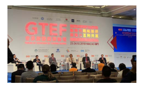
Field trip to Global Tourism Economy Forum (GTEF)